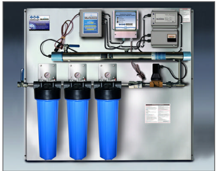
TWT-MD-1005, (15 GPM)

The TWT® All-In-One water filtration, disinfection and purification systems are unique, compact, self-contained units (easy installation & operation).